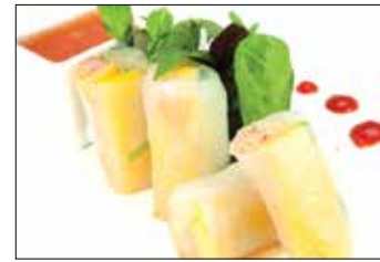
Summer Roll $6