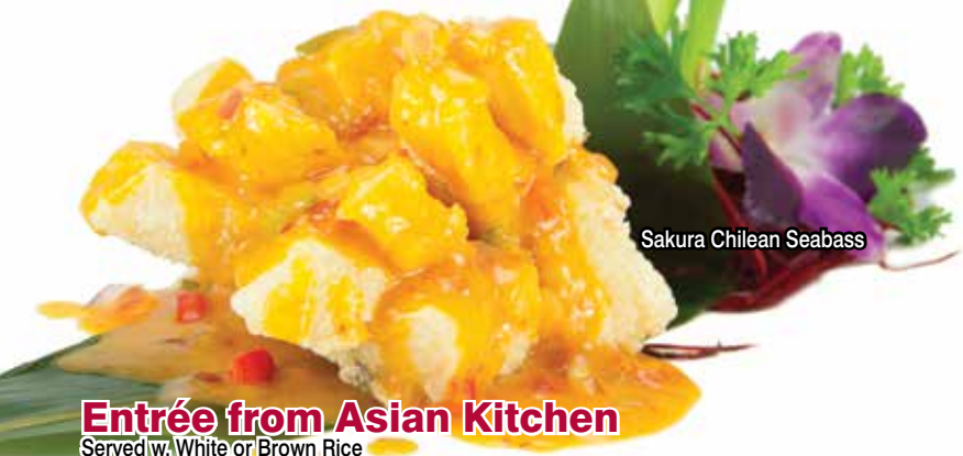
Sakura Chilean Seabass