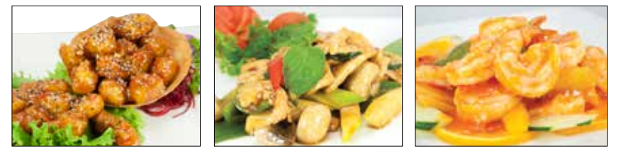
Crispy White Meat Sesame Chicken, Thai Basil Chicken, Mild mango Jumbo Shrimp