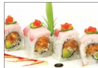
Yellowtail Lover's Roll $12