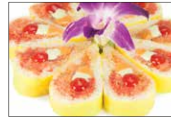
Thursday Roll $12