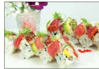
January Roll $13