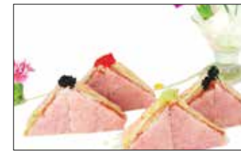
February Roll $12