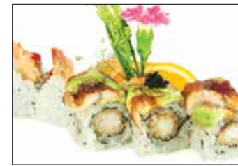
Eel Special Roll $14