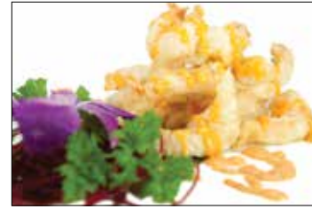
Spicy Rock Shrimp $7