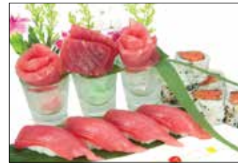
Tuna Lover $22