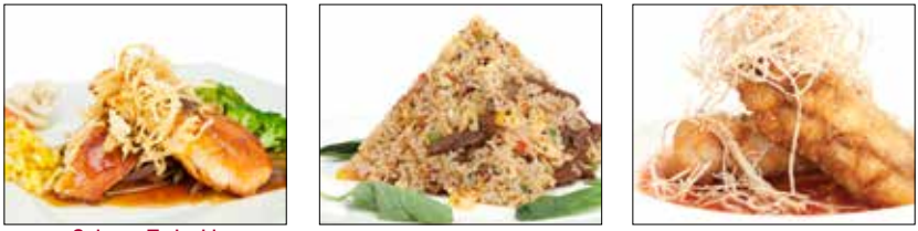
Salmon Teriyaki, Malaysia Fried Rice, Red Snapper