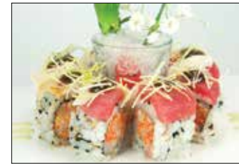
November Roll $12