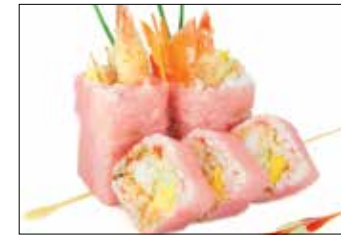
Friday Roll $13