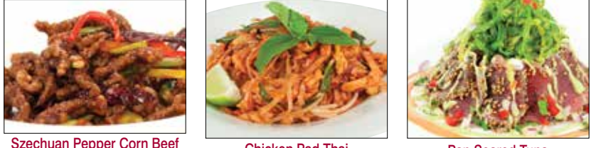
Szechuan Pepper Corn Beef, Chicken Pad Thai, Pan Seared Tuna w. Soba Noodles