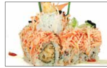
Pink Dragon Roll $12