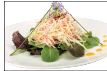
Kani Salad $6