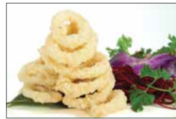
Crispy Calamari $8