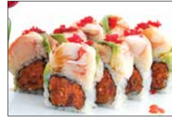
Fancy Lobster Roll $15