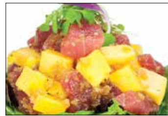
Tuna Mango Salad $11