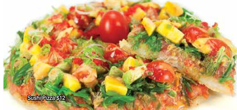
Sushi Pizza $12

* Consuming raw or undercooked meats, poultry, seafood, shellfish, or egg may increase your risk of foodborne illness, especially if you have certain medical conditions