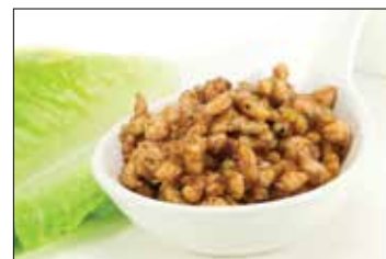
Chicken Lettuce Wrap $8