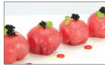
Tuna Ball $10