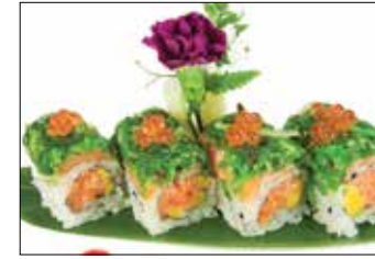
July Roll $12