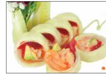
Sunday Roll $15