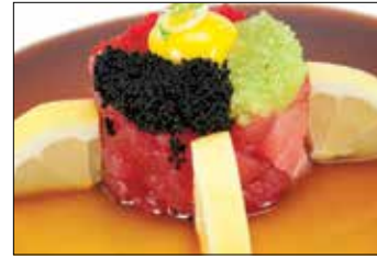
Tuna Tartar $10