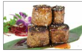
Beef Negimaki $8