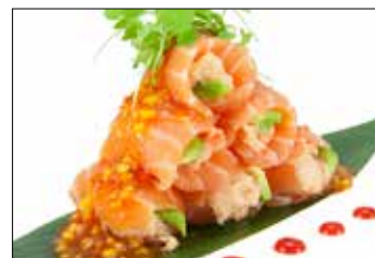
Salmon Samba $10